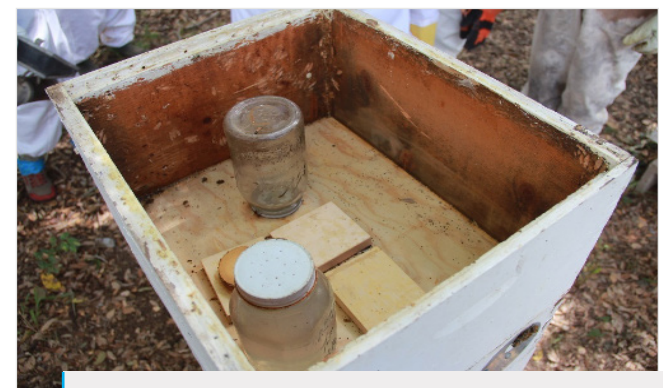
Figure 6. Homemade internal top feeder. Empty box with plywood bottom. Holes the size of jar tops drilled out of the bottom so jars can be placed upside down. Jar tops have numerous small holes so sugar water can be extracted by honey bees' lapping mouthparts.