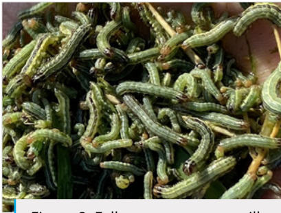
Figure 3. Fall armyworm caterpillars collected with a sweep net.

There are multiple methods to scout for FAW caterpillars. The most effective method to scout for FAW caterpillars is with a sweep net (Fig. 3). By sweeping the net from side to side, the caterpillars are collected and are easily counted. The more common method is to get on your hands and knees and closely inspect the grass. During hot days, check the lower parts of the plant or soil surface where they may be hiding from the harsh temperatures. Another method is to run your hands across a 1- to 2-square-foot area to knock the caterpillars to the soil surface. Then, simply inspect the soil for dislodged caterpillars.