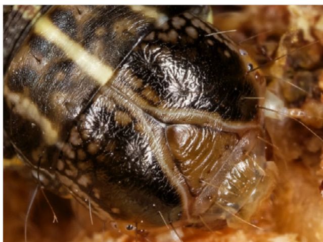
Figure 2. Fall armyworm caterpillar with inverted “Y” pattern.

FAW caterpillars are primarily identifiable by two features. The head will have apparent white markings that form an upside-down “Y” pattern (Fig. 2). The second feature are raised black spots which form a rectangular pattern on the last few segments of the caterpillar.