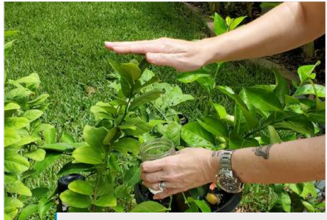
A way to remove pests without spraying pesticides is to tap pest insects into a jar filled with isopropyl alcohol. You can also hand pick and throw pests into a bucket of soapy water.