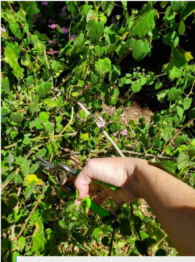
Pruning can physically remove pests from plants as well as increase air circulation to reduce fungal diseases.