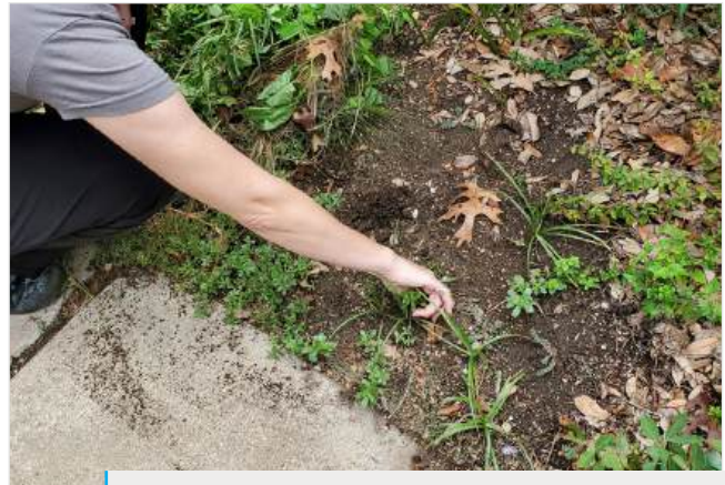
Pulling weeds can reduce areas where pests hide as well as reduce plants that pests may feed on early in the season before moving into the garden.