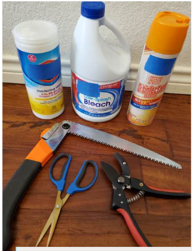
When pruning, make sure to clean tools between plants with a 10 percent bleach solution or a similar product to reduce the transfer of plant diseases within the garden.