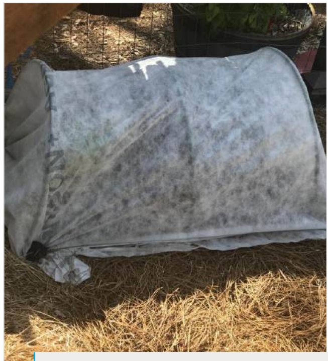
Row cover is a way to keep insect pests from reaching plants. It is important to cover plants before they have pests and to make sure the row cover is tight against the ground so insects cannot crawl under it.