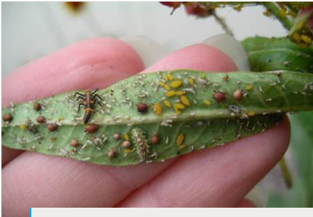
Biological control is using natural organisms to manage pests. The aphids in this image are being controlled by ladybug larva (black and orange), syrphid fly larva (green), and parasitic wasps that turn aphids into “mummies” (the puffed up brown aphids).

that location or sacrificed. Otherwise, the insect population will build up on the trap crops and move into plants they should not be feeding on.