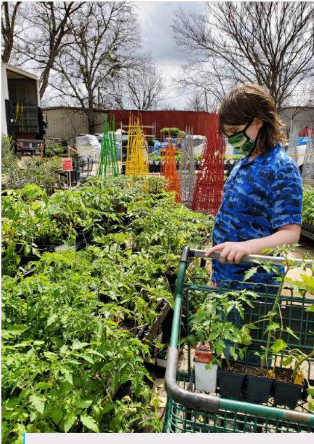
Choosing healthy plants can be a great way to start your landscape. Choose plants that are native or adapted to your area as well as ones that are pest- and disease-free.

water requirements. Resistant varieties may be available to ward off certain types of pests. Space plants to allow room for growth.