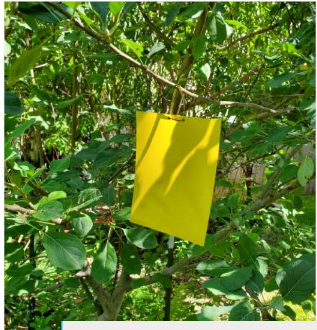
Traps can not only allow you to monitor pest populations, they can also reduce the population.

water loss from the soil via evaporation. It also can reduce plant fungal diseases by not allowing fungal spores to splash from the soil onto the plant. Other benefits of mulch are improving soil structure and water movement through the soil.