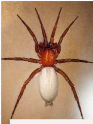
Figure 1. Ground spider showing cephalothorax, abdomen, and eight legs.

Spiders are arachnids and are more closely related to mites and scorpions than to insects. Like insects and other arthropods, arachnids have a hard outer exoskeleton and jointed legs. Arachnids are