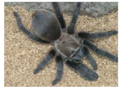
Figure 2. Tarantula, Aphonopelma .

Tarantulas are among the largest spiders in Texas. Despite their size and fearsome reputation, tarantulas are shy and are seldom seen. The common Texas brown tarantula (genus Aphonopelma ) can have leg spans of more than 3 inches when fully grown (Fig. 2).