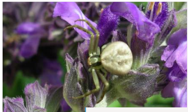
Figure 8. Crab spider on a flower.

Crab spiders, in the family Thomisidae, are common on leaves and flowers (Fig. 8), and some species are found on the ground. These spiders are easily recognized by the crab-like way they hold their two front pairs of legs and the way they scuttle sideways and backwards. These spiders do not spin a web, instead they ambush their insect prey. Some crab spider species can change color to match the flower on which they are perched.