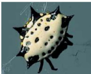
Figure 6. Spinybacked orbweavers are common in wooded areas.

The black and yellow garden spider, Argiope aurantia , is common in Texas, and is the best known in the group (Fig. 5). The female's body is more than 1 inch long and its legs are even longer. Male Argiope are often less than one fourth the size of females and can be found in the same web with the female. Grasshopper-sized insects are often caught and eaten by these large spiders.