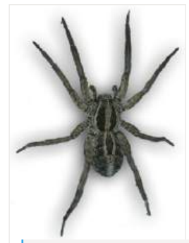
Figure 4. Wolf spider, Schizocosa spp.

Hundreds to thousands of wolf spiders may live in the average backyard lawn, where they feed on insects and small organisms. Although they may be a nuisance, they can control other pests. Because they are so plentiful, wolf spiders commonly enter homes under gaps in doorways. Although some wolf spiders can be aggressive if handled improperly, they are generally not dangerous to people or pets and can usually be picked up with bare hands or slid onto a piece of paper and relocated outdoors.