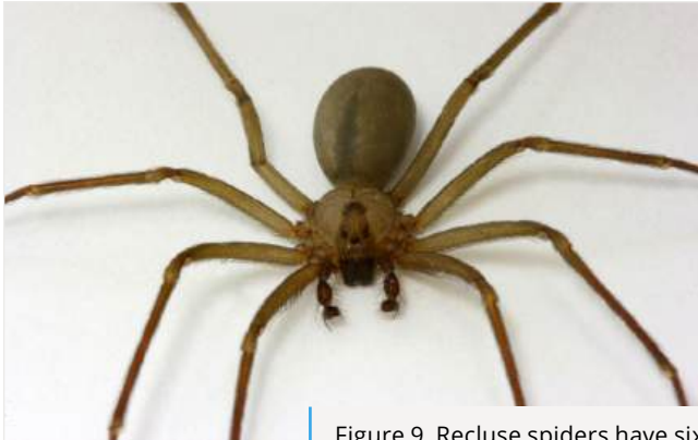
Figure 9. Recluse spiders have six eyes arranged in three pairs.

Brown recluse spiders, Loxosceles reclusa , have only six eyes arranged in pairs, which differentiates them from many other spiders (Fig. 9). Adults usually have a dark, violin-shaped mark on the cephalothorax with the neck pointing back toward the abdomen. They are usually light to dark brown and have no spines on their legs.