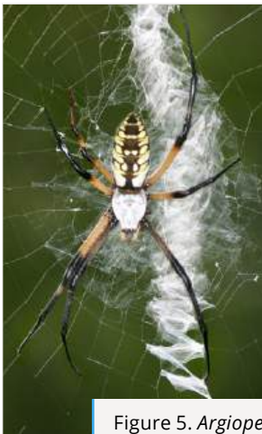
Figure 5. Argiope spider in a web.

Unlike jumping and wolf spiders, orbweavers do not see well. Instead, they use the web to get information from the environment and to locate insects that are caught in the web. Prey is usually quickly subdued by wrapping it in silk so the web is not destroyed. Though orbweavers are harmless to people, their large webs can be a nuisance.