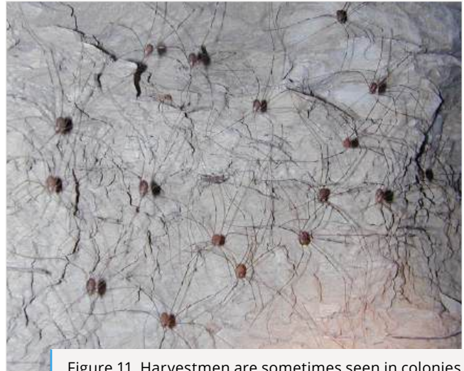
Figure 11. Harvestmen are sometimes seen in colonies, where they may bounce up and down together.

Harvestmen, though closely related, are not spiders. In harvestmen, the cephalothorax and abdomen are broadly joined, creating a large, oval-shaped body (Fig. 11). Like spiders, harvestmen have eight legs that often are very long, though some have short legs. Many are brown to gray, but some have brighter coloration.