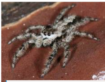
Figure 3. Adult jumping spider.

Jumping spiders, in the family Salticidae, are easy to distinguish from other spiders. Jumping spiders tend to