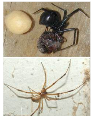
Figure 10. Female widow spider (top), male widow (bottom).

Adult female widow spiders are typically black. Males and juveniles may have orange, red, and white markings on the back and sides (Fig. 10). The abdomen is rounded and the ventral region often has two reddish triangles that form an hourglass shape. Some of these spiders have irregular or spot-like markings. Others have no markings at all.