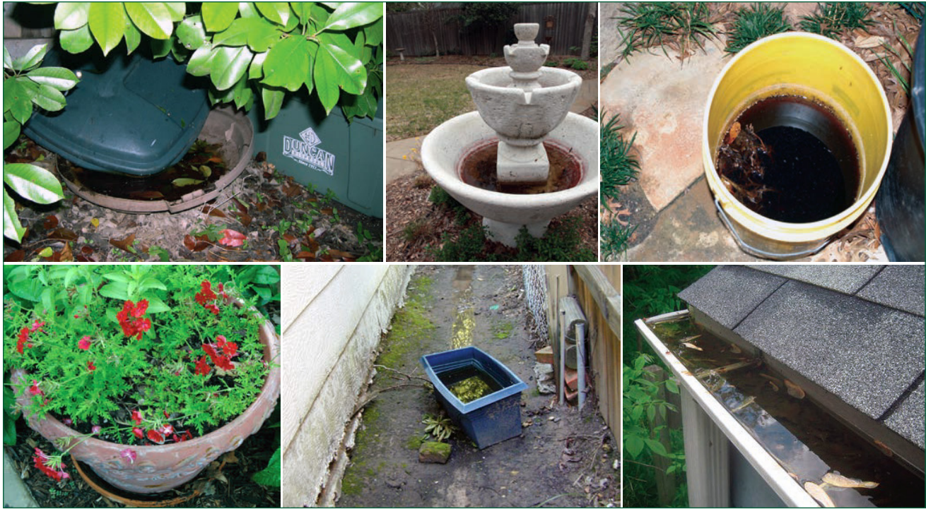
Figure 6. Artificial containers that can serve as mosquito egg-laying sites: (from top left) a garbage can lid, birdbath, plastic bucket of water, flowerpot, plastic container, and a clogged rain gutter.

ual homeowners as well as organized areawide efforts led by groups such as local government agencies or private companies.