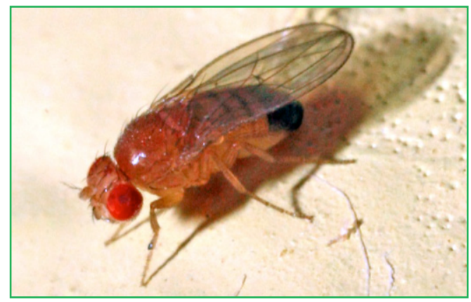
Figure 1. Fruit flies are one of the most well studied insects because of their usefulness in genetics research. Their stocky bodies and red eyes help distinguish fruit flies from other small indoor flies.

Fruit flies (Family Drosophilidae) are common indoors and out. Infestations are most frequent during the summer when fruit flies are active outdoors—