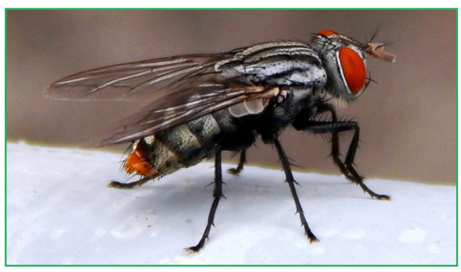
Figure 7. Flesh flies are large gray flies that occasionally enter homes when attracted by the odor of a dead animal in an attic, chimney, or wall.

Carrion flies include flesh flies (Family Sarcophagidae) and blow flies (Family Calliphoridae). Immature stages of blow flies feed on decaying organic material—especially dead animals but also garbage, manure, or other rotting plant material. Blow fly larvae are creamy white and legless. Sometimes referred to as maggots, blow and flesh fly larvae are cylindrical and taper to a pointed head. The presence of these larvae in a home usually indicates that a bird, squirrel, rat, etc., has died somewhere in the structure.