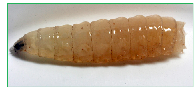
Figure 9. Blow fly maggots may wander into living spaces of homes prior to their change into an adult fly.

Adult blow flies are shiny blue or green and are ¼ to ¾6 in long (6 to 11 mm). Flesh flies are large (¾ to ¾ in, 10 to 16 mm) and gray with black stripes on the thorax. The tip of the abdomen is red or pink in some species.