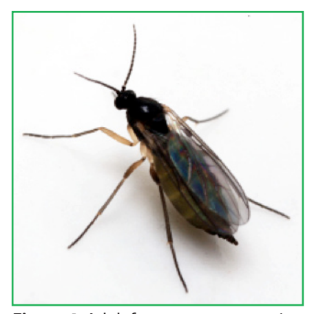
Figure 4. Adult fungus gnats emerging from potting plants do not bite, but can be highly annoying indoors.

Fungus gnat larvae (¼ in, 6 mm) live in moist locations such as potting soil. They are