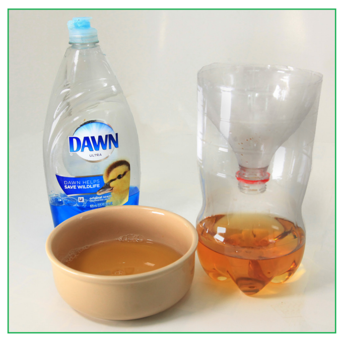
Figure 7. Inexpensive fruit fly traps can be made with readily available items. An open bowl with a liquid attractant and small amount soap will catch lots of flies (soap breaks the liquid surface tension, causing landing flies to drown). Another effective trap can be made by cutting off the top (funnel section) of a 2 liter soft drink bottle. By inverting the top inside the base you create a funnel trap into which fruit flies can fly, but not easily escape. Good attractants include apple cider vinegar, red wine, beer, or just sugar water and yeast.

In natural settings, fruit flies are attracted to fermenting fruits. Suitable attractants for traps include