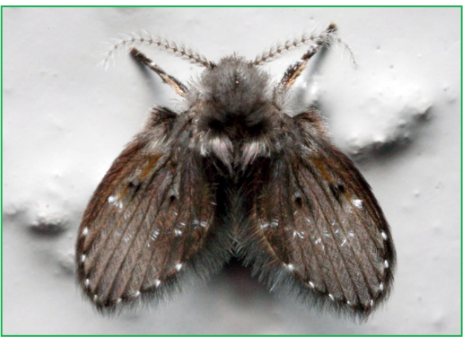
Figure 3. Moth flies, also called drain flies, breed in microbial films that grow in drains. These moths are often seen resting on walls near the drains from which they emerge.

Adult drain flies are small ( \frac{1}{16} to \frac{1}{5} in, 2 to 5 mm), greyish, and densely covered with hairs. They hold their broad wings either flat or like a roof over the body at rest. Drain flies usually fly only a few feet at a time.