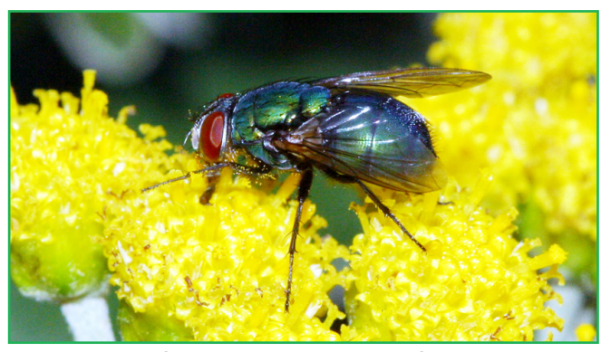
Figure 8. Blow flies are normally outdoor flies, but will enter homes to lay eggs on dead rodents, birds or other carrion.

Maggots in homes are usually those that have completed feeding and are searching for a place complete their metamorphosis. Left undisturbed, they will pupate in a crack or other protected spot and emerge as an adult fly.