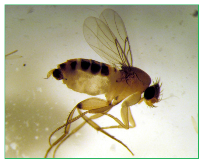
Figure 2. Phorid flies are similar in size to fruit flies, but are humpbacked, with strong veins along the front edge of the wings. These flies frequently run or hop rather than fly, as suggested by their enlarged femur in the hind pair of legs.

Phorid flies (Family Phoridae) are another fly found in homes and, even more commonly, in commercial buildings. They are approximately the same size as fruit flies (½ inch, 2 to 4 mm) but have a hump-backed appearance. They are tan to dark-brown or black. Phorid flies have dark veins along the front edge of their wings. The veins in the central part of the wings are almost parallel and lack the linking cross veins seen in most other fly wings. Phorid flies have enlarged femurs on the third pair of legs, which make them good runners. They often run and stop repeatedly before taking wing, giving them another common name, "scuttle fly."