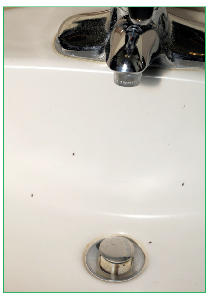
Figure 10. Sinks are common breeding sites for moth flies and fungus gnats.

To check whether a drain is breeding site, place a length of clear packing tape across the drain without