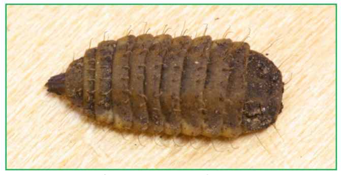
Figure 6. Soldier fly larvae are one of the strangest looking insects likely to be found indoors. They are most commonly associated with compost bins or a dead animal in the structure.

Soldier flies (Family Stratiomyidae) are outdoor flies that occasionally enter homes and buildings. Indoors, these flies are most commonly seen as full-grown larvae that have completed feeding and are searching for a place to develop (pupate) into an adult. During this wandering phase, soldier fly larvae may travel several yards from their breeding site, and may be seen wriggling along a floor, patio, or fireplace hearth. Soldier fly larvae are about 1 inch long, legless, grey to dark brown, and flattened. The "skin" is has a distinctive, leathery texture. Though not harm-