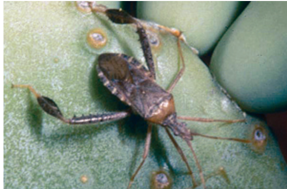
Figure 1. A leaf-footed bug (possibly Leptoglossis species) on prickly pear cactus.