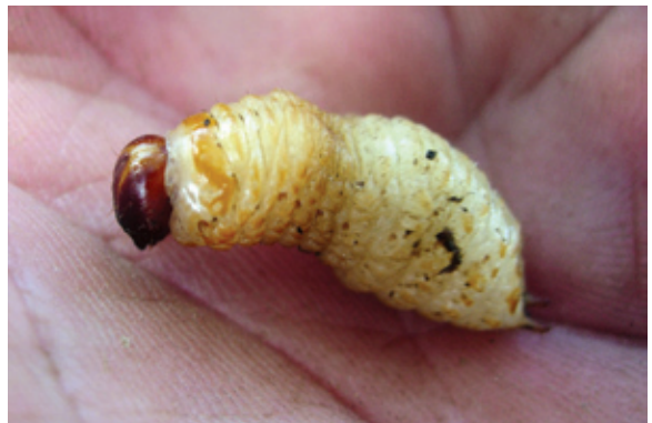
Figure 11. Larva of agave weevil.