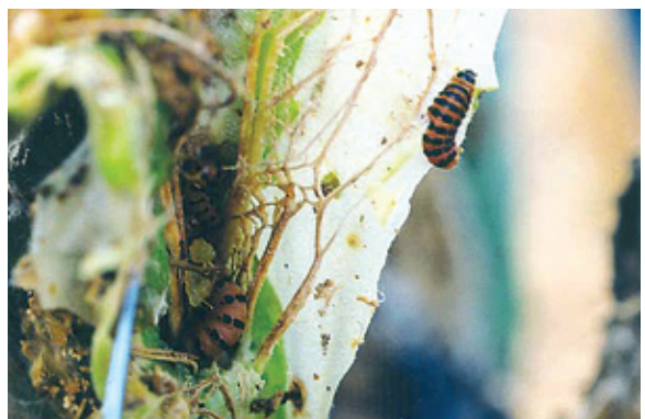
Figure 12. Cactus moth ( Cactoblastis cactorium ) on prickly pear cactus in Australia.