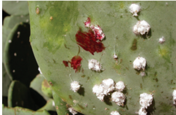
Figure 7. Cochineal scale ( Dactylopius coccus ) on prickly pear cactus.

Adults of the most common Texas species, Moneilema (probably armatum ), are black and about 1 inch long. They do not fly (Fig. 9).