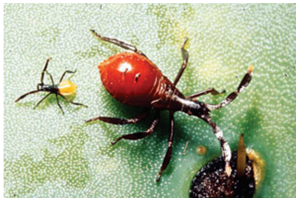
Figure 3. Chelinidae vittiger nymph on prickly pear cactus.