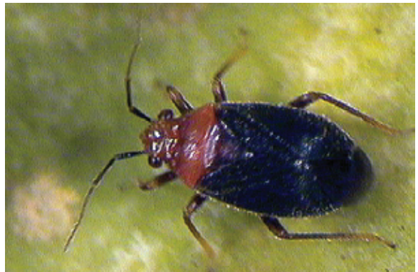
Figure 5. Halticotoma (Miridae) species on yucca.