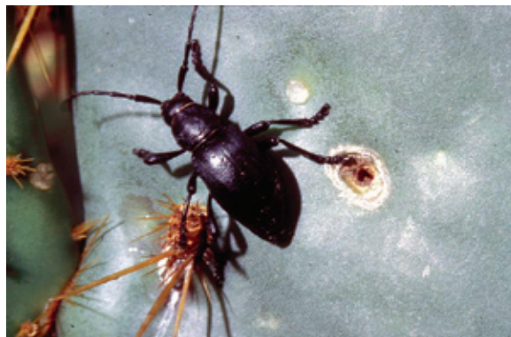
Figure 9. Long-horned beetle (Cerambycid; Moneilema , probably armatum ) on prickly pear cactus.