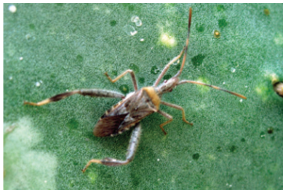
Figure 2. Narnia species on prickly pear cactus.