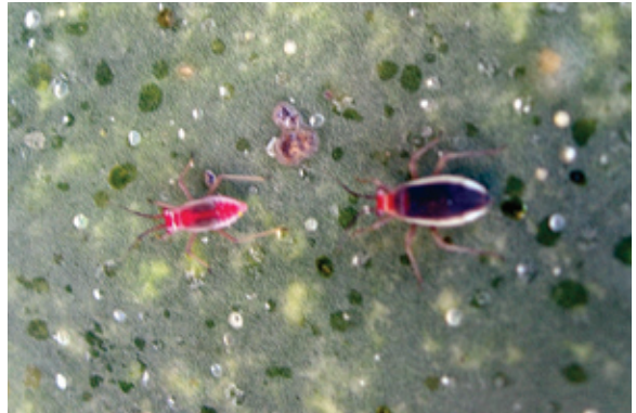
Figure 4. Hesperolabops gelastop on prickly pear cactus.

Texas sage in the landscape can be damaged by the lantana lace bug, Teleonemia scrupulosa (Tingidae; Fig. 6). Damaged leaves appear speckled with pale (chlorotic) spots. Heavily infested shrubs may be defoliated and decline in health. Adult and developing stages reside on the undersurface of leaves and leave dark specks from their waste.