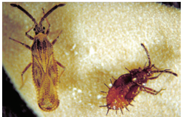
Figure 6. Lantana lace bug, Teleonemia scrupulosa , on Texas sage.