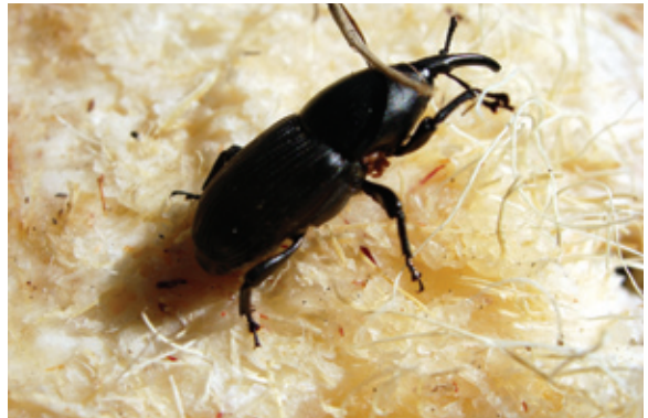
Figure 10. Adult agave, or sisal, weevil (Curculionidae; Scyphophorus acupunctatus ) on yucca.

Cactus moth caterpillars have alternating bands of orange and black. The caterpillars, or moth larvae, feed together while mining