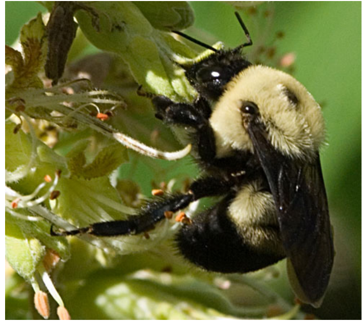
Figure 6. Adult female brownbelted bumble bee, Bombus griseocollis (DeGeer).

Bombus griseocollis (DeGeer) 1773, the brown-belted bumble bee. Its range extends from Quebec and Maine to Florida, and throughout the American West (DL 21011). Florida county records include Alachua, Clay, Collier, Highlands, Marion, Osceola.