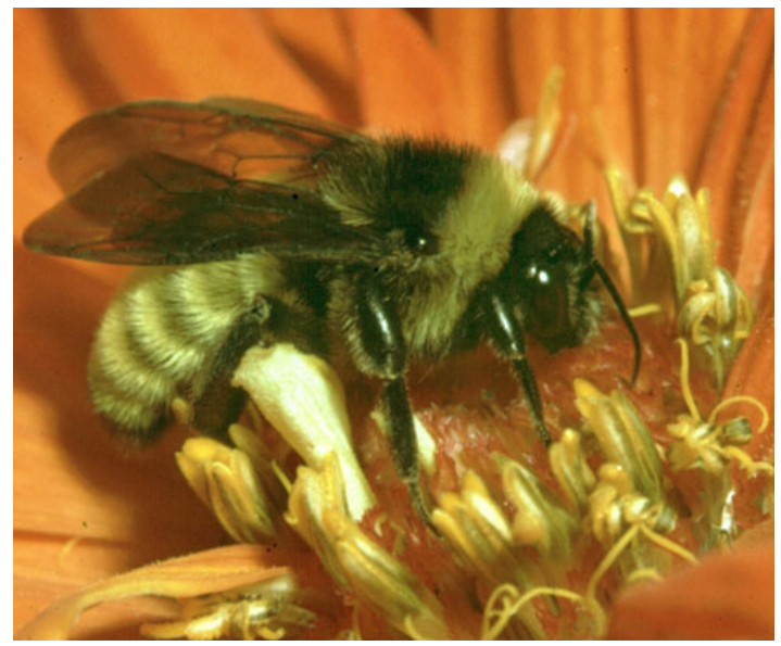
Figure 1. Adult bumble bee, Bombus sp.

Most bumble bees are large, social bees that produce annual colonies. Mated queens overwinter in the soil and emerge from hibernation in early spring when they feed on spring flowers and search for a suitable location, such as a former rodent burrow in the soil, to begin their colonies. These are beneficial insects that pollinate many native and ornamental plants. They can sting severely, so problem nests near human dwellings should be removed by experienced pest control operators.