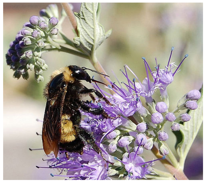
Figure 8. Adult female American bumble bee, Bombus pennsylvanicus (DeGeer).

Bombus pennsylvanicus (DeGeer) 1773, the American bumble bee. Its range extends from Quebec and Ontario, Maryland south to Florida, then west to Minnesota, South Dakota, Nebraska, Colorado, New Mexico, and Mexico (Anonymous 2011). Florida county records include Alachua, Bradford, Collier, Escambia, Flagler, Highlands, Lake, Lee, Levy, Marion, Orange, Putnam, Sarasota, Santa Rosa.