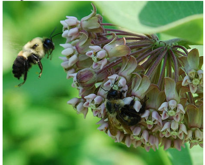
Figure 4. Adult female twospotted bumble bee, Bombus bimaculatus Cresson.

Bombus bimaculatus Cresson 1863, the twospotted bumble bee. Its range extends from Ontario to Maine, south to Florida, and west to Illinois, Kansas, Oklahoma, and Mississippi. Florida county records include Alachua, Clay, Franklin, Highlands, Lake, Levy, Marion, Okaloosa, and Orange.