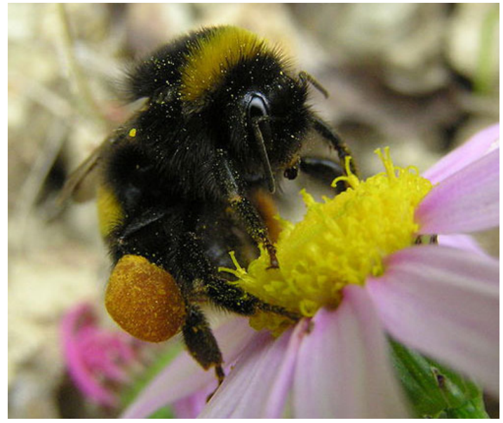
Figure 2. A bumble bee, Bombus sp., with full pollen basket.

sometimes listed as a sub-genus. The parasitic species are easily distinguished by the lack of the corbicula. The most common of this group found in Florida is B. variabilis .