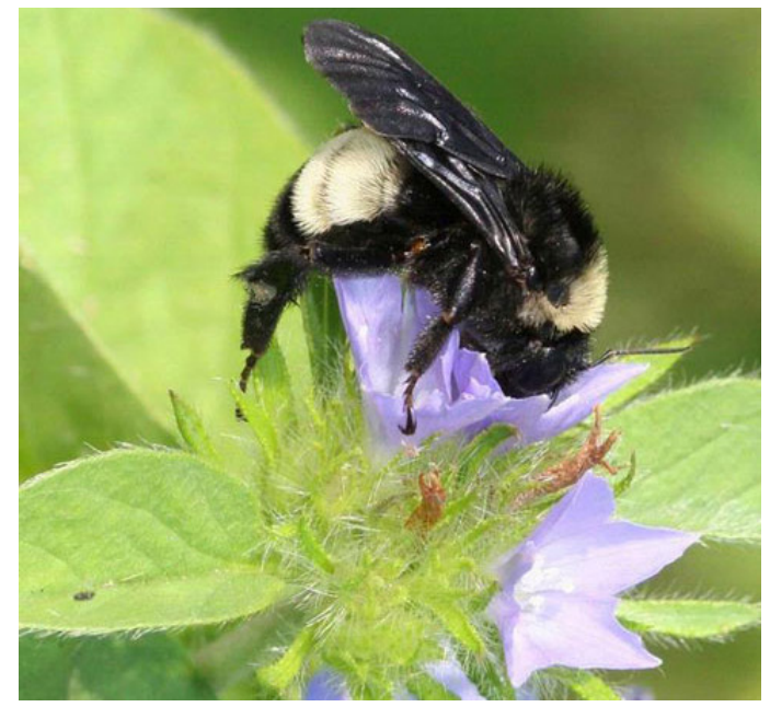
Figure 5. Adult female southern plains bumble bee, Bombus fraternus (Smith).

Bombus fraternus (Smith) 1854, the southern plains bumble bee. Its range extends from New Jersey to Florida, and west to North and South Dakota, Nebraska, Colorado and New Mexico. Florida county records include Alachua, Franklin, Gadsden, Levy, Liberty, Orange, and St. Johns.