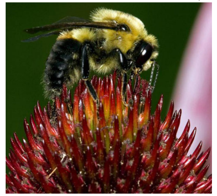
Figure 7. Adult female common eastern bumble bee, Bombus impatiens Cresson.

Bombus impatiens Cresson 1863, the common eastern bumble bee. This species is native from Ontario to Maine and south to Florida and was introduced in California and in British Columbia, Canada (EOL 2011). Florida county