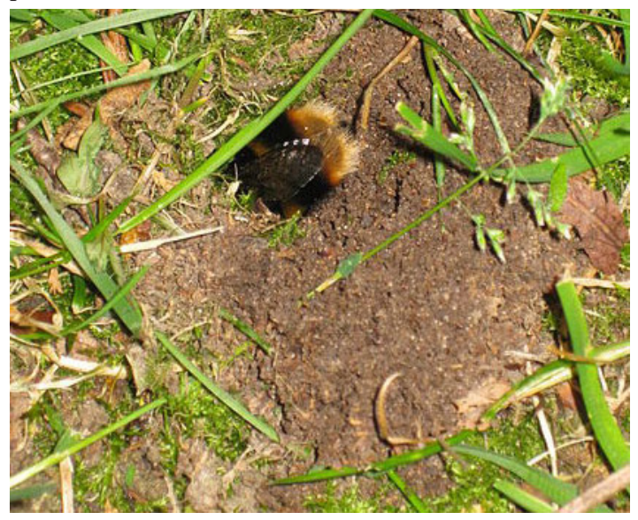
Figure 3. A bumble bee emerging backwards from her nest.

Once a nest site is found, the social bumble bee queen collects pollen and lays her first brood of worker eggs. Workers emerge about 21 days after the eggs are laid and take over the duties of pollen and nectar collection as well as colony defense. The size of the workers increases with each new brood. A third caste of bumble bees, the males, is usually produced in midsummer.