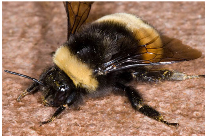
Figure 9. Adult female yellow-banded bumble bee, Bombus terricola Kirby.

Bombus terricola Kirby 1837, the yellow-banded bumble bee. Originally, this species extended from Nova Scotia to Florida, west to British Columbia, Montana and South Dakota. While once common, it has declined dramatically