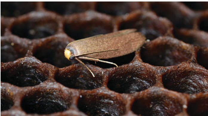
Figure 1. An adult lesser wax moth, Achroia grisella Fabricius, on a piece of brood comb.

Achroia grisella Fabricius, the lesser wax moth (Figure 1), is considered a pest of unoccupied honey bee, Apis spp., hives and stored hive materials. However, wax moths can be considered beneficial insects in wild/feral colonies because they destroy combs that remain after a colony of bees dies or abandons the nest site. These abandoned combs potentially harbor pathogens and/or pesticide residues that have been left behind by the previous colony. Wax moths consume the abandoned combs, thereby minimizing the risk for exposure to future inhabitants of the cavity. Lesser wax moths have a similar life history to that of greater wax moths, Galleria mellonella L.