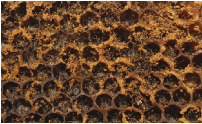
Figure 6. Wax moth damage to wax comb. The damage is the result of wax moth feeding, larval webbing, and frass.