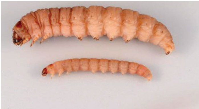
Figure 3. Late instar greater wax moth, Galleria mellonella L., larva (top) and lesser wax moth, Achroia grisella Fabricius, larva (bottom). The two species are similar in appearance with the major difference being size.