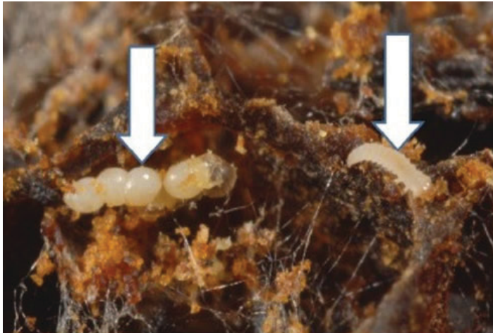
Figure 2. Eggs (left) and a first instar (right) of the greater wax moth, Galleria mellonella L., shown here due to the lack of images of lesser wax moth, Achroia grisella Fabricius, eggs and first instar larvae. Lesser wax moth eggs are very similar to the eggs of the greater wax moth.

Larvae tunnel through beeswax comb spinning tunnels of silk, which they cover in frass (feces). The larval stage is the only life stage that eats. Larvae typically consume comb containing bee brood (honey bee larvae and pupae), pollen, and honey. Larvae prefer brood and pollen comb to virgin and/or honey comb. However, lesser wax moths are often found feeding on the hive floor because greater wax moths outcompete them for the desirable brood comb in areas where both species co-occur.