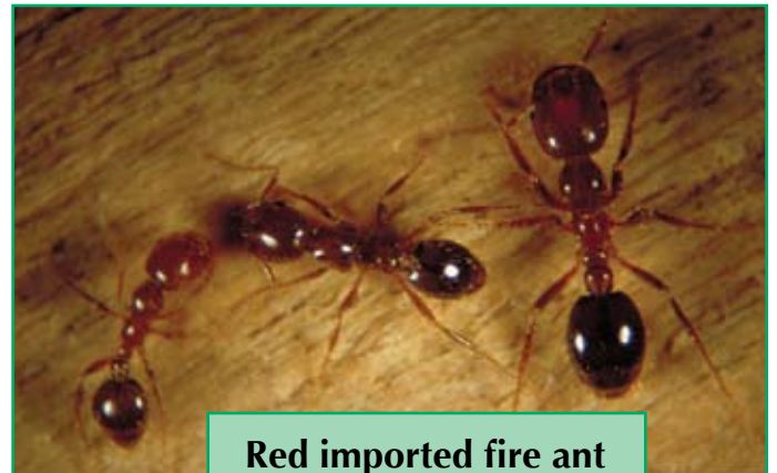
Red imported fire ant

Red imported fire ant, Solenopsis invicta