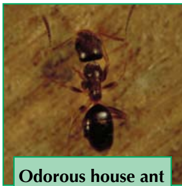
Odorous house ant

but have a pungent “rotten coconut” smell when crushed. This species is easily identified because all the workers are the same size and they are active during the day. They form large colonies, and their nests contain more than one queen ant.