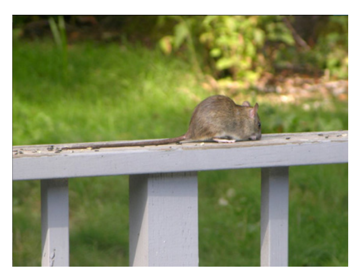
Figure 4. Rattus rattus by Alex O'Neal (CC BY-SA 2.0)

This material is based upon work that is supported in part by the National Institute of Food and Agriculture, U.S. Department of Agriculture (USDA NIFA), under award number 2017-70006- 27145, which provides Extension IPM funding to University of Arizona. Any opinions, findings, conclusions, or recommendations expressed in this publication are those of the authors and do not necessarily reflect the view of the U.S. Department of Agriculture. Additional support is provided by the University of Arizona – Arizona Pest Management Center (APMC).