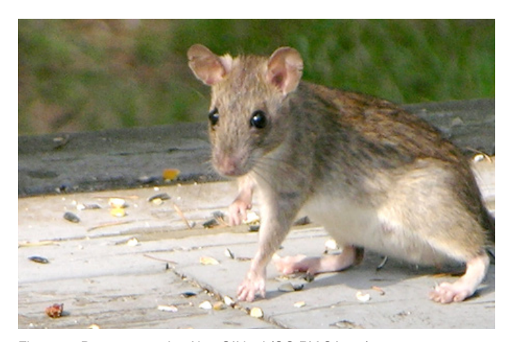
Figure 1. Rattus rattus by Alex O'Neal (CC BY-SA 2.0)

While the Oriental rat flea is the natural ectoparasitic flea of roof rats, many other species are found. This includes the northern rat flea ( Nosopsyllus fasciatus ), especially where roof rats and Norway rats ( Rattus norvegicus ) occur in the same environment. Additionally, dog fleas ( Ctenocephalides canis ), cat fleas ( Ctenocephalides felis ), and sticktight fleas (Figure 2 Echidnophaga gallinacea ) are all found on roof rats, sometimes