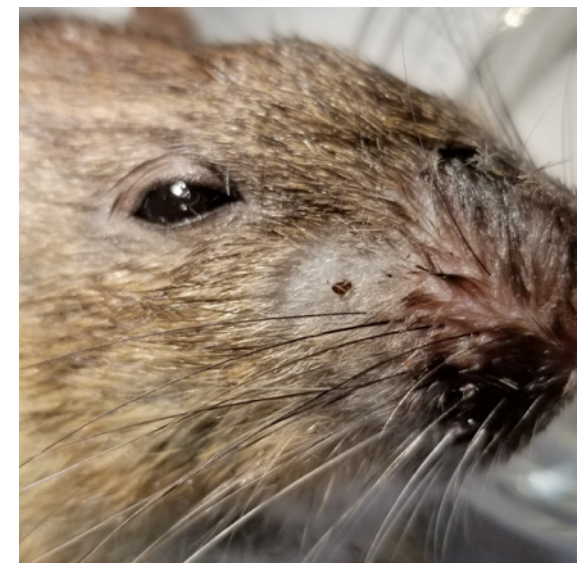
Figure 2. Sticktight flea ( Echidnophaga gallinacea ) on a Norway rat

in larger numbers than Oriental rat fleas. Similarly, a variety of mites may utilize rats as hosts.