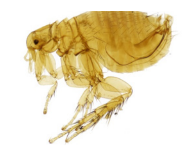
By Olha Schedrina / The Natural History Museum - http://data.nhm.ac.uk/object/c11c05ab-189f-4a19-826f-873bbd04b3c6

Adults are hard-bodied (difficult to crush between fingers), light to dark brown coloration, 1.5 to 4 mm in length with three pairs of legs.