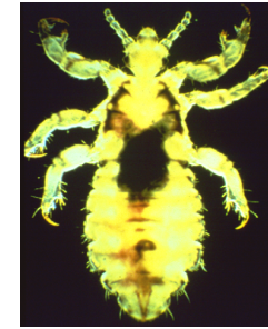
Figure 1: Head Louse Pediculus capitis

Head lice are small, wingless parasitic insects. They are typically 1/6-1/8 inch long, brownish in color with darker margins. The claws on the end of each of their six legs are well adapted to grasping a hair strand.