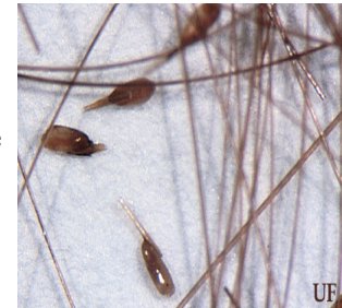
Figure 2: Nits (lice eggs)

Female head lice glue their grayish-white to brown eggs (nits) securely to hair shafts. The eggs are resistant to pesticides, and they are difficult to remove without a special 'nit-comb.'