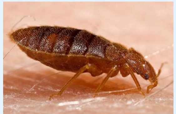
Bed bug images