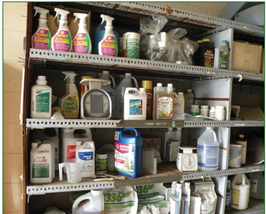
Any pesticides kept on school grounds should be stored in locked areas accessible only to properly trained and licensed professionals.

For over two decades, schools have been using IPM to reduce pesticide use and associated costs. In 1985, the Montgomery County Public Schools in Maryland made 5000 pesticide applications. Just three years later, after transitioning to IPM practices, only 600 pesticide