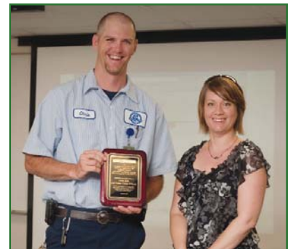
An IPM coordinator is a wise investment in a healthier, safer community.

In North Carolina, the Union County School District has saved $18,000 in fire ant treatments alone with the implementation of an IPM program in 2002 (North Carolina Public School Maintenance Association 2011).