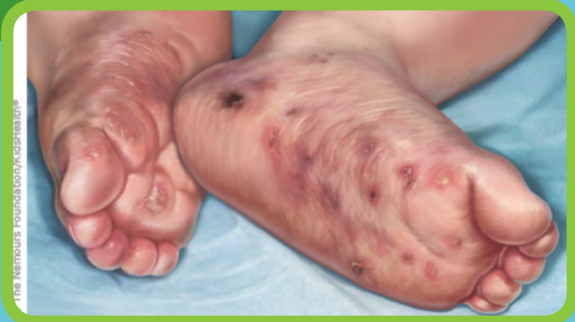
Above: Figure 3. Scabies rash: Small, pus-filled bumps on the sole are often a sign of scabies in infants and young children.