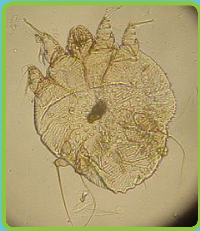
Above: Figure 1. A photomicrograph of an itch mite ( Sarcoptes scabiei ). (wikipedia.org/).

The itching and rash may affect any part of the body. Commonly affected areas include the webbing between the fingers, wrists, elbows, armpits, waist/belt-line, buttocks and genitalia.