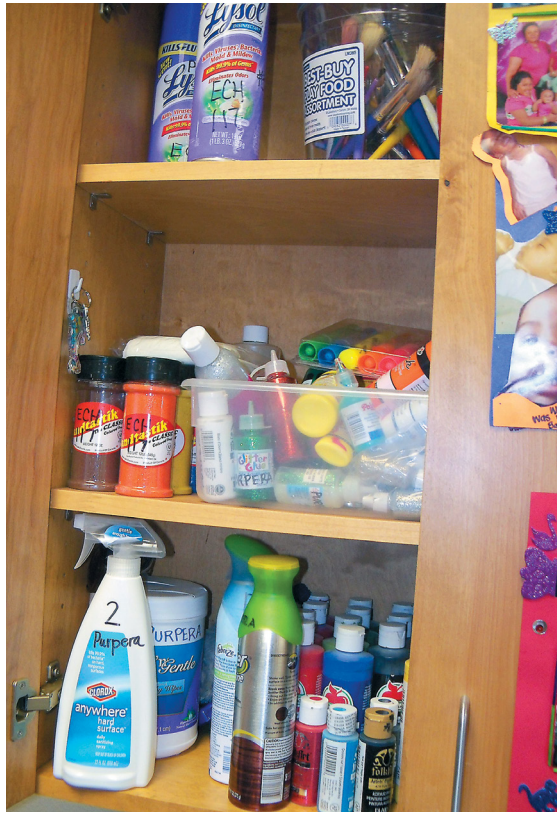
Fig. 3. An example of how pesticides often stored on school grounds, in a closet or area with additional types of supplies.

“legacy” pesticides in storage (Green et al. 2007). In some states, the combination of poor storage practices and a lack of requirements for applicator training could have potentially harmful consequences (Fig. 3).