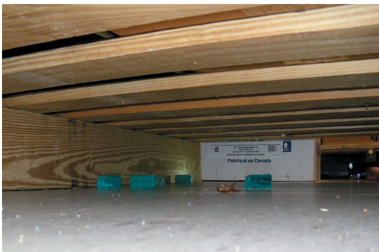
Fig. 2. Underneath a dry storage pallet: illegal placement of rodent bait blocks, evidence of American cockroaches, and general uncleanliness.

Federal roles in pesticide safety and IPM are addressed in the Federal Insecticide, Fungicide, and Rodenticide Act (FIFRA, 1947, 2007), which provides for federal regulation of pesticide distribution, sale, and use. Under FIFRA, all pesticides distributed or sold in the U.S. must be registered by U.S. EPA unless they meet specific criteria for exemption, such as containing ingredients generally recognized as safe (7 U.S.C. § 136e). U.S. EPA