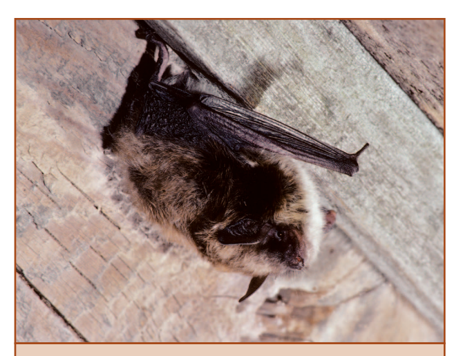
Figure 3. Big brown bats often roost in manmade structures.