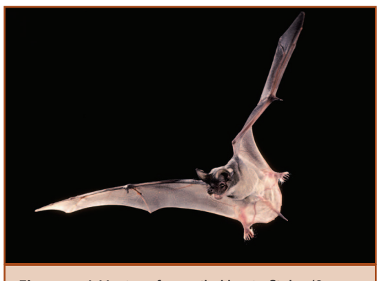
Figure 1. A Mexican free-tailed bat in flight.