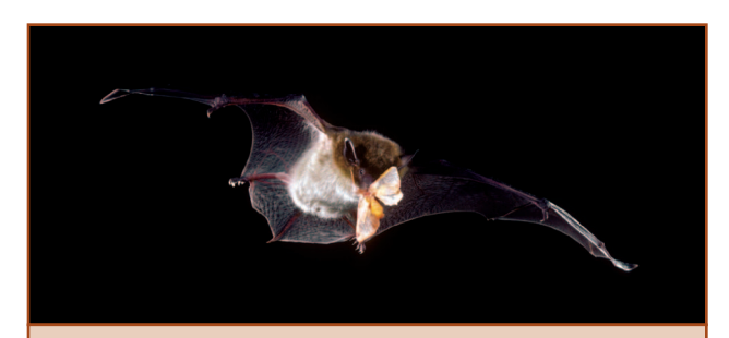
Figure 2. A big brown bat that has captured a moth.

To prevent or minimize problems associated with bats, school district personnel should understand basic information about bats, rabies, and the laws pertaining to bats. Each district should develop a site-specific bat management plan that includes education, training, prevention, and response strategies for bats. The goal of the management plan is to keep people safe without harming the bats.