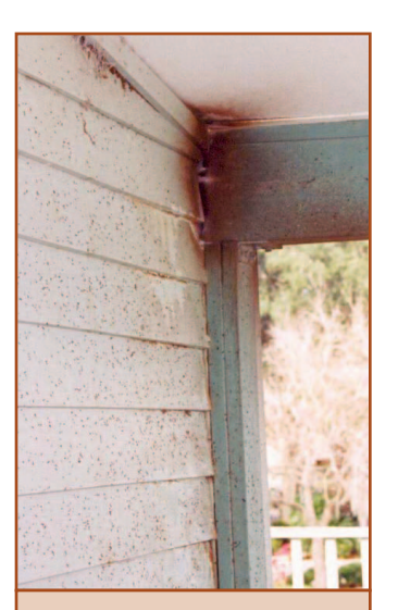
Figure 10. Staining can indicate a bat entry/exit point.

When inspecting the exterior of the building, look along roof lines and behind gutter placement for rub marks, which are stains left by the oils and