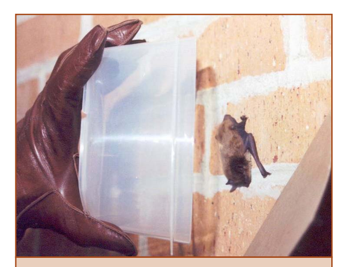
Figure 8. To capture a bat, place a box or can over the bat and carefully slip a piece of cardboard under the bat, trapping it in the box.

http://www.youtube.com/watch?v=mzax 0V0DG_M.