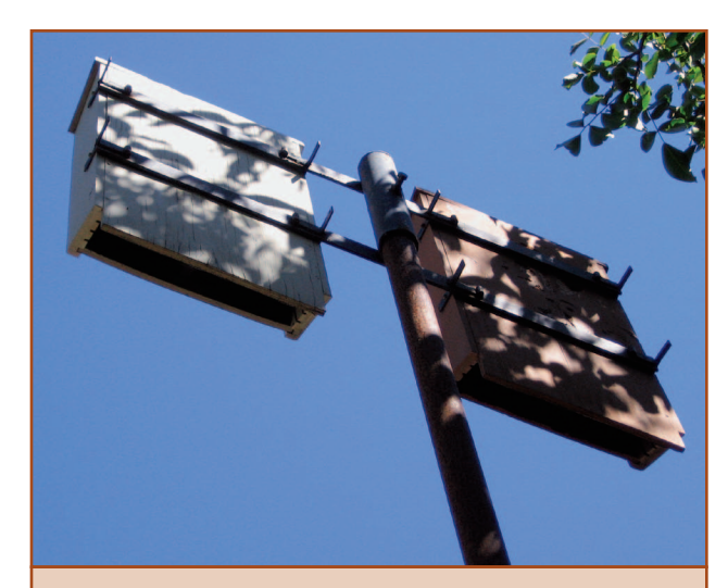
Figure 11. Alternative bat houses should be big enough to house several hundred bats.