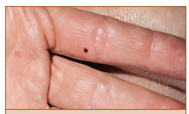
Figure 4. Marks from a bat bite can be tiny or even invisible.

themselves from bites. School faculty, staff, and students should be trained to respond appropriately to bat incidents.