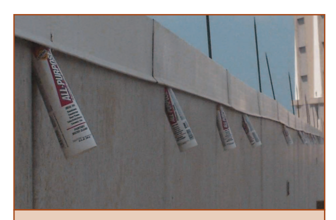
Figure 12. In long areas, place eviction tubes about 6 feet apart along the entire distance to enable all the bats to exit.