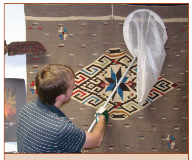
Figure 7. A bat inside a building is captured with a net.

1. Gather these items before approaching the bat: a long-sleeved shirt or jacket, a pair of thick work gloves, a plastic face shield, a small container such as a cardboard box or coffee can, a sturdy piece of cardboard, and masking or duct tape. A net also may be used (Fig. 7).