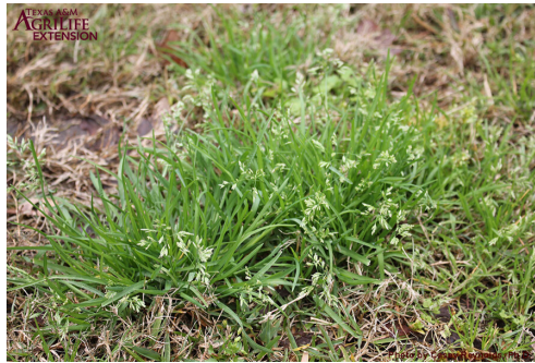
Annual Bluegrass Poa annua L.