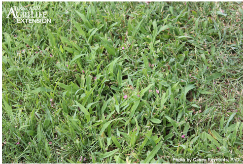
Large Crabgrass Digitaria sanguinalis (L.) Scop.

Common lawn weeds that can be prevented with the use of preemergence herbicides.