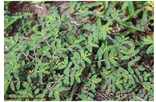
Spotted Spurge Chamaesyce maculata L.